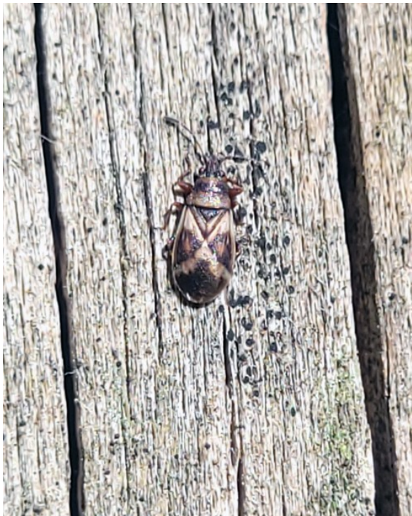
Fig. 1.- Specimen of Oxycarenus (Pseudoxycarenus) modestus (Fallén, 1829) photographed in Caldas de São Jorge (Santa Maria da Feira, Portugal) on 18/01/2026.

WALKER, F. 1872. Catalogue of the Specimens of Hemiptera Heteroptera in the Collection of the British Museum. Part V. Trustees of the British Museum, London. 202 pp.