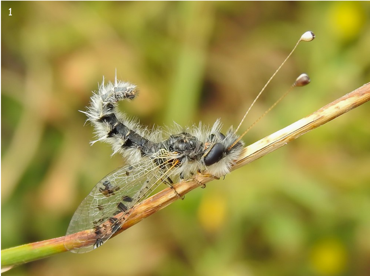
Fig. 1.- The specimen of Puer maculatus (Olivier, 1789) photographed in São Brás de Alportel (Faro, Portugal) on 19/05/2024 (MHNCUP-ART-42328).